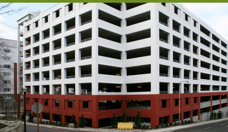
P-305A Parking Garage, Naval Base Kitsap-Bremerton, Bremerton, WA