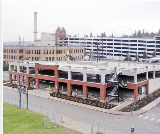
P301A Bachelor Enlisted Quarters Parking Garage, Naval Base Kitsap-Bangor, Silverdale, WA