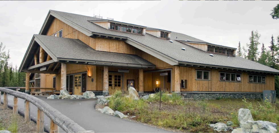
Eielson Visitor's Center, Denali National Park, Denali, AK