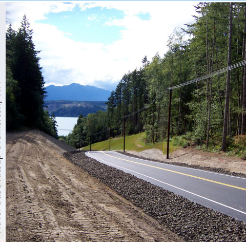
Greenling Road, Naval Base Kitsap-Bangor, WA