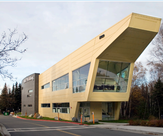
Alaska Native Science & Engineering Program Facility, Anchorage, AK