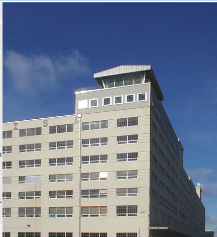
Port Operations Tower, Naval Base Kitsap-Bremerton, WA